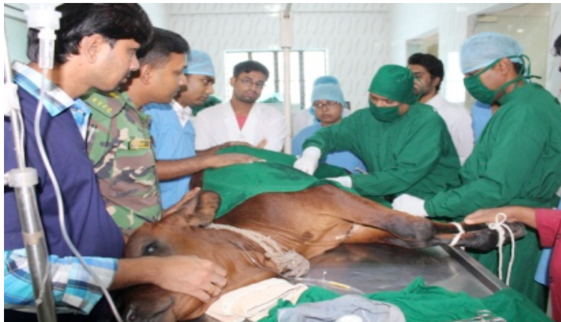
Figure 5: PBL Session at CVASU