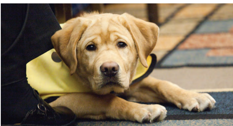
An example of more than one species in attendance at the conference.

A leadership workshop at the conference covered how different people play different roles in innovation and creativity and what this means for improving scholarship, enhancing diversity, and strengthening development in order to heighten overall performance and effectiveness, individually and collectively.